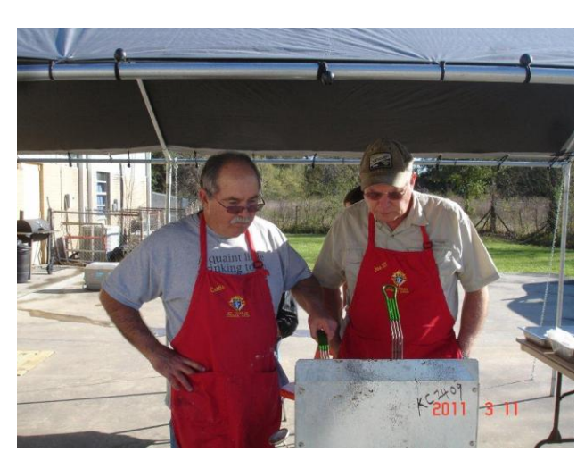
Use the float rule guys!