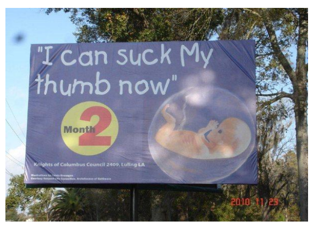
Council Right to Life billboard