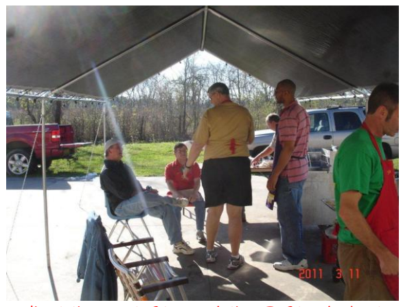
What the past G.K. and the P.G.K. do best. Delegate baby!!!