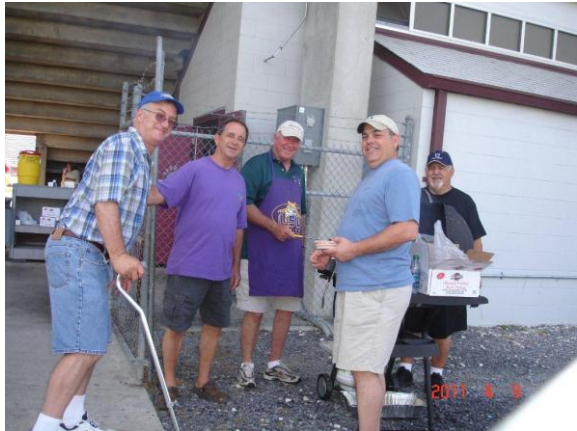
Helping out at the Senior Special Olympics