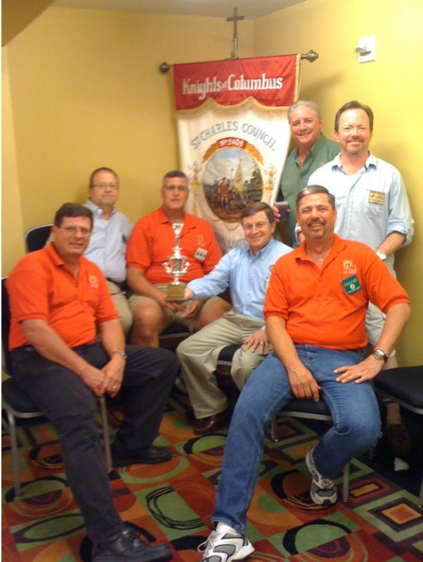
Celebrating our 1st place finish at the state deputy hospitality suite.