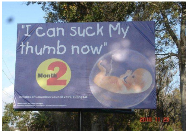
Council Right to Life billboard

Happy April birthday to the following council members: