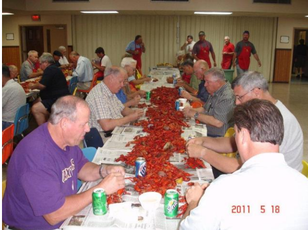
I can't believe that some actually use this for bait!

making our crawfish boil a success year after year. From ordering, picking up, boiling, and of course my specialty, eating them.