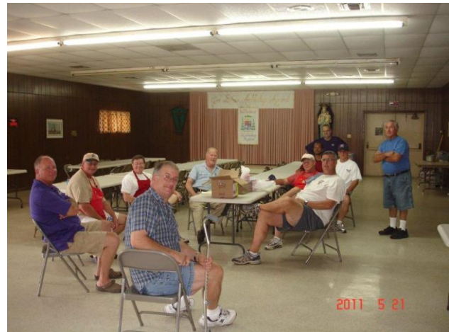
Planning session for Sunday morning. Only one thing to plan, BE THERE EARLY!!!

Council 2409 held its spring barbecue chicken dinner on Sunday May 22 nd at the Holy Rosary Church Community Center in Hahnville. Five hundred chicken halves were grilled and served along with baked beans and cole slaw. Thanks to all who help make this event a huge success. Proceeds from the fundraiser helps support youth group activities not only in our area, but throughout the state.