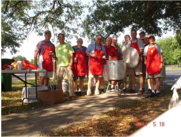
The guys that make it happen