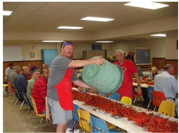
Fresh out the pot.