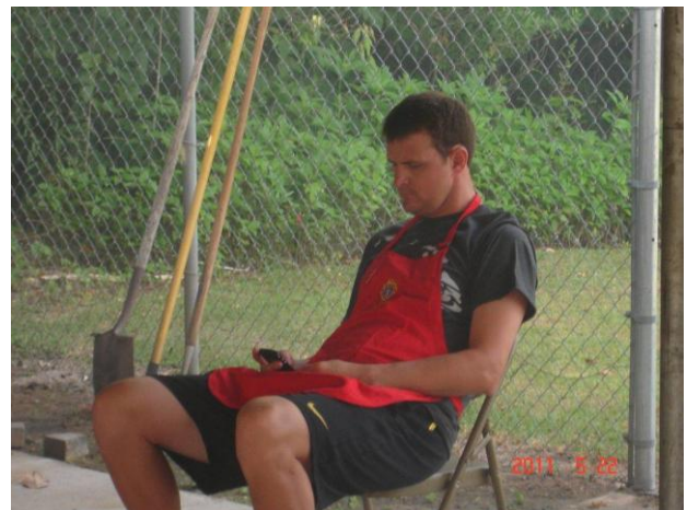
Modern technology. We take orders by text messages and cell calls, no problem.