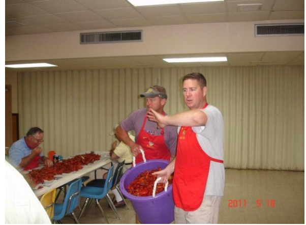
Alright, alright already, I'm coming with more, Jeez!!!!