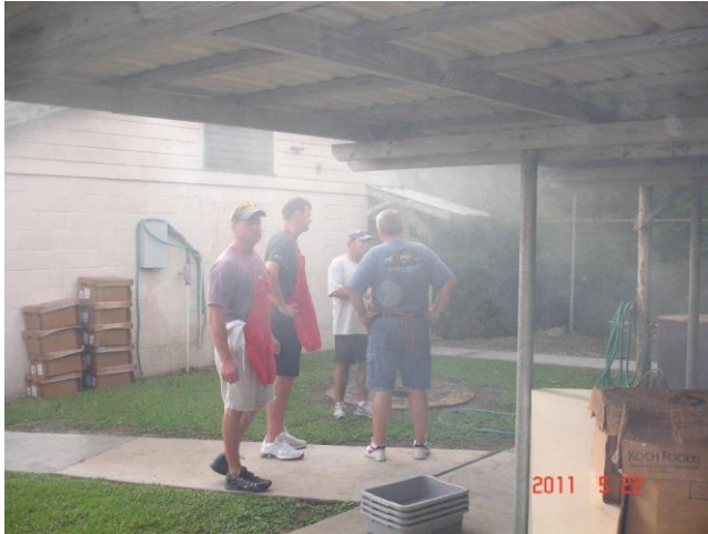
Okay, let's roll!