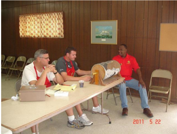
The council raffle that accompanies the dinner is always a huge success.