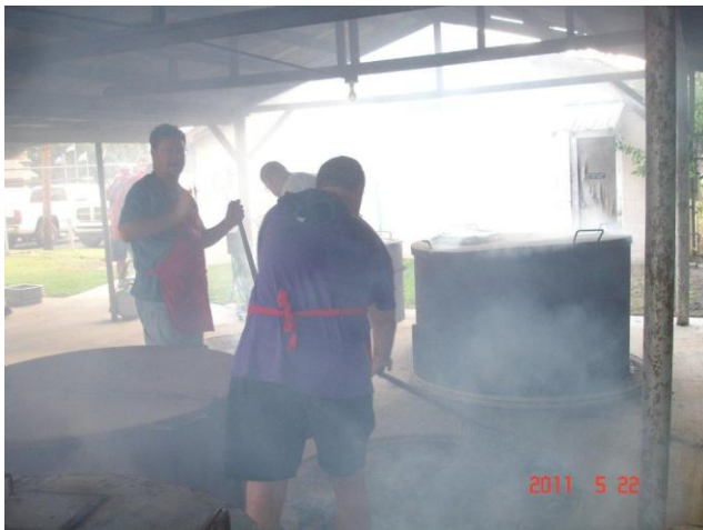
I forgot. Are serving barbecue or smoke chicken?