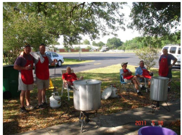
Good friends and boiled crawfish. Don't get much better than this!!