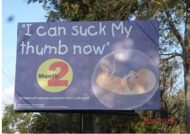
Council Right to Life billboard

Happy May birthday to the following council members.