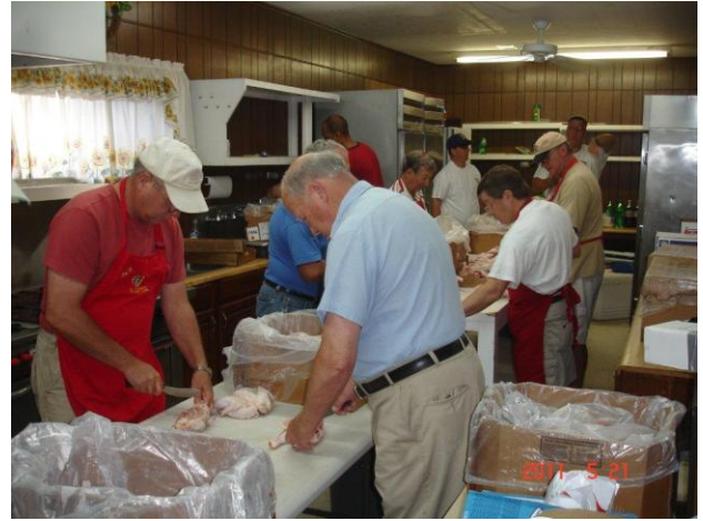
Saturday preparation. Don't forget to tuck those wings!!!