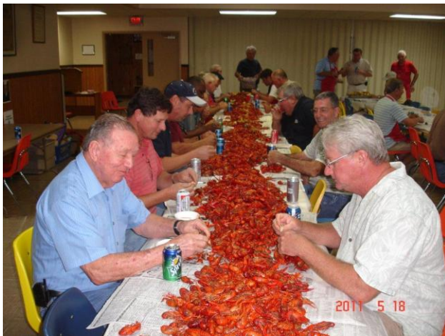
Don't be messin with my pile Douglas!!