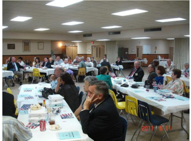
Enjoying the festivities