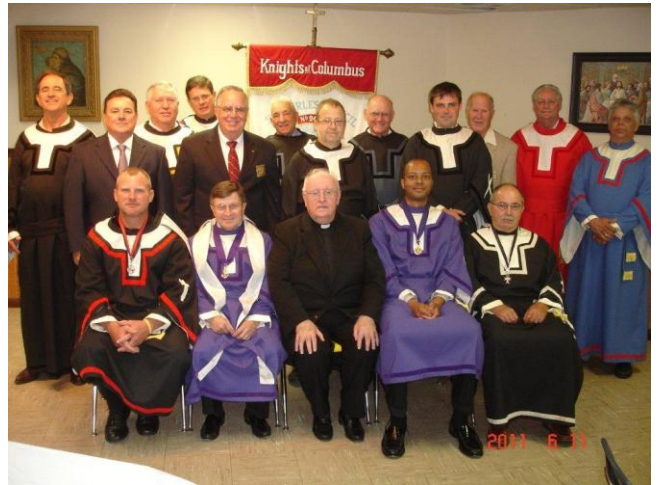
2011-2012 Council 2409 Officers