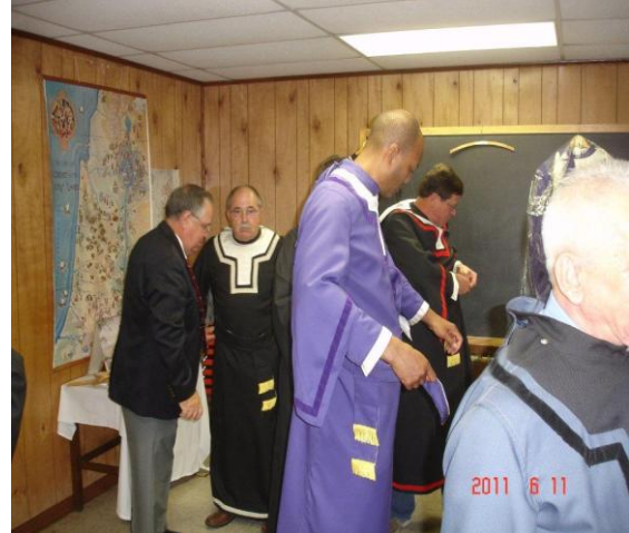
These robes sure don't fit like they USED to!!!