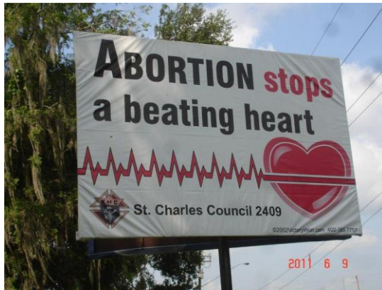
Council Right to Life billboard

Happy August birthday to the following council members.