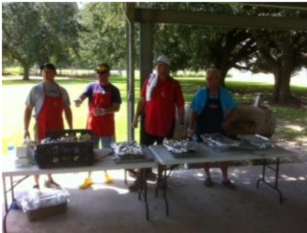
Cooks and servers from Council 2409 at the 2011 Special Olympics.