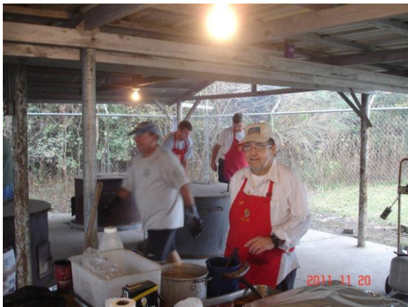
The "sauce master" only an Oubre can know the real ingredients of this famous basting sauce!!