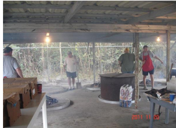
Getting the coals right is not taken lightly by these guys.

We would like to thank all the brother knights who came out and helped with our barbeque chicken dinner. Our fall dinner's proceeds go directly to the annual MDF (Mentally Disabled Fund) event sponsored by the Knights of Columbus. Local organizations that are impacted directly by our MDF dinner are the Special Olympics and The Arc of St. Charles.