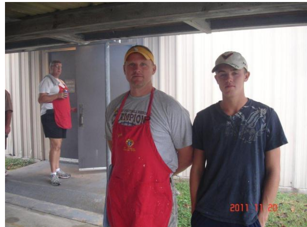
Yes, my young apprentice. One day you will master the force of the grill and earn the right to wear the famous Council 2409 aprin!