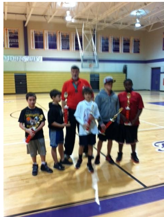
Area free throw boys winners