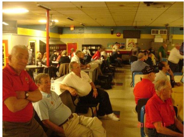
I guess I'll have to start bowling on Monday morning with these guys if I want to improve.