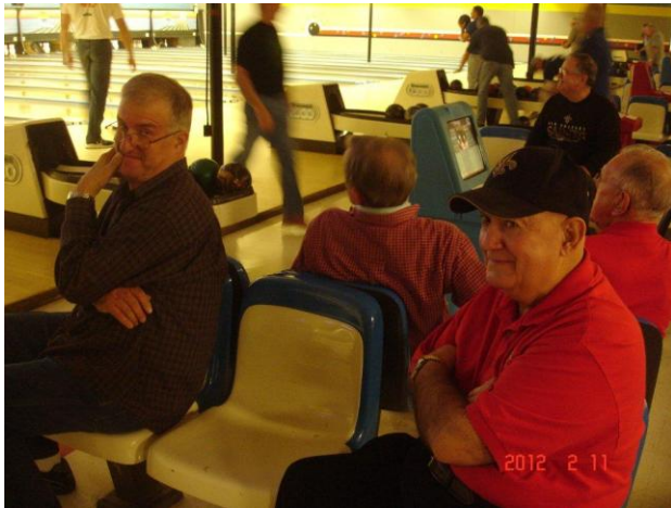
Tommy, did you see that gutter ball ☺