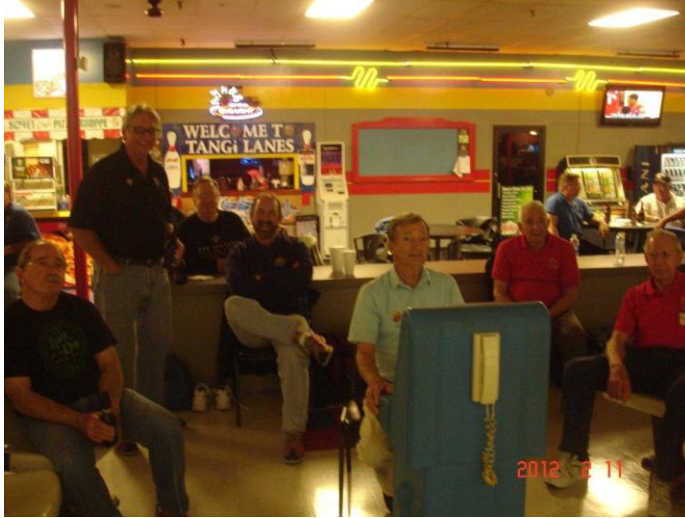
Oh well, we didn't win the state title, but what a GREAT time!!