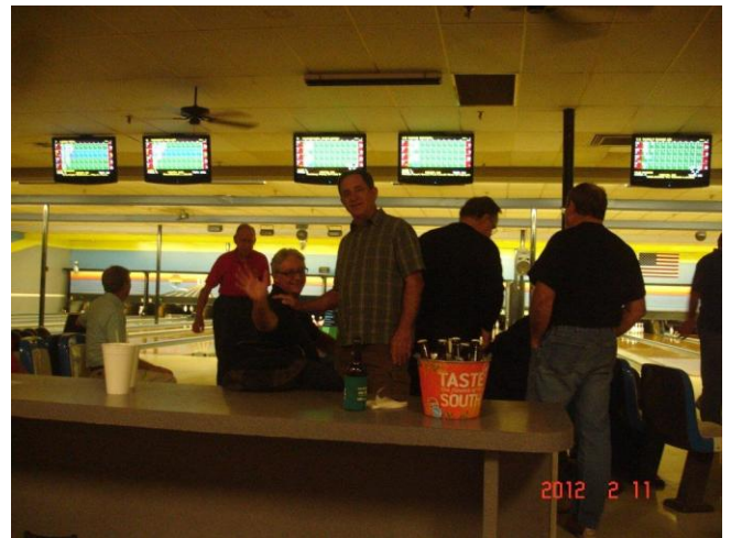
Here's my strategy, get another bucket!