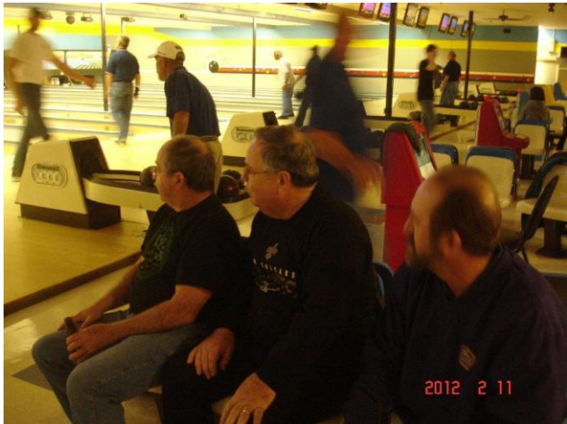
I'm thinking my teammates are wondering if I will ever bowl more than a 5 in a frame!