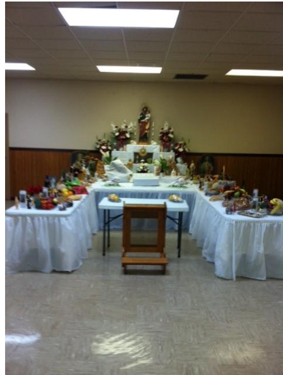
St. Joseph's Altar

Today, the St. Joseph's altar is constructed in three tiers representing the Three Persons of the Blessed Trinity.