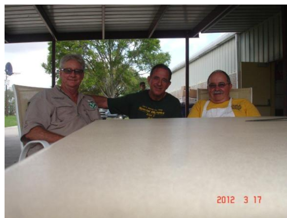
Time to take a break