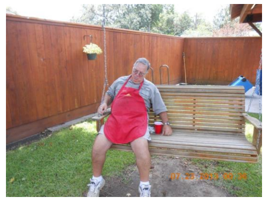
Like I said, the day started early!!!