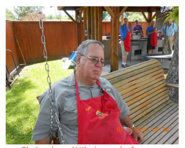
Obviously, a little too early for some. Barbequing sausage must be a hard job or could it be the Bloody Mary's ©