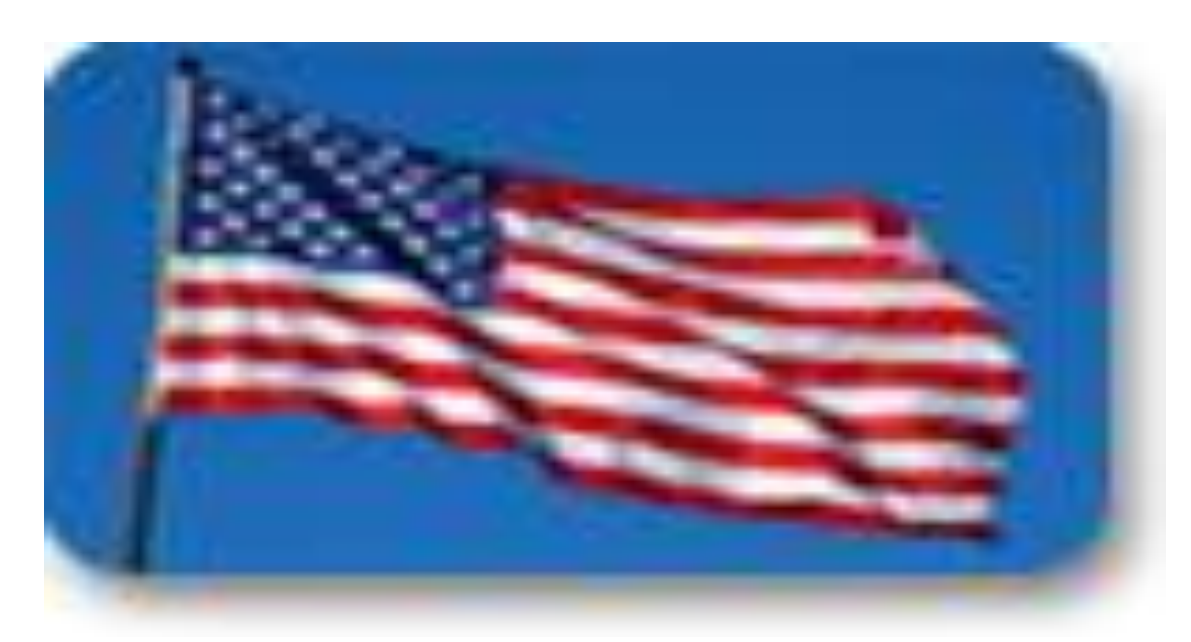
THE FLAG OF OUR COUNTRY OUR RED, WHITE AND BLUE. OUR TROOPS ARE DEFENDING IT. WE MUST ALL PRAY FOR WORLD PEACE.