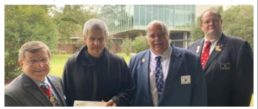
Seminary Mission Fund Donation to St. Joseph Seminary