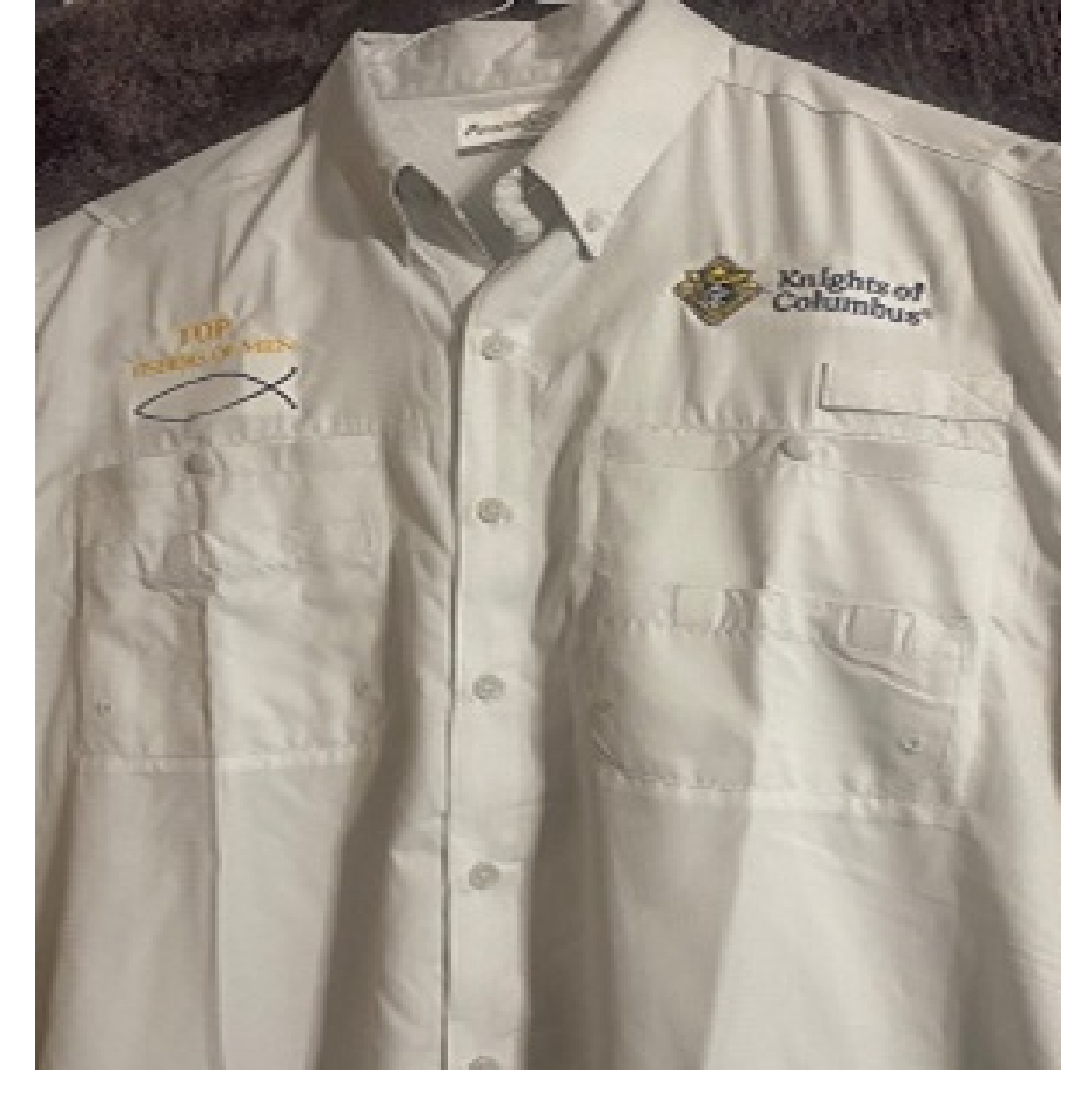
Remember to KEEP CHRIST in CHRISTMAS