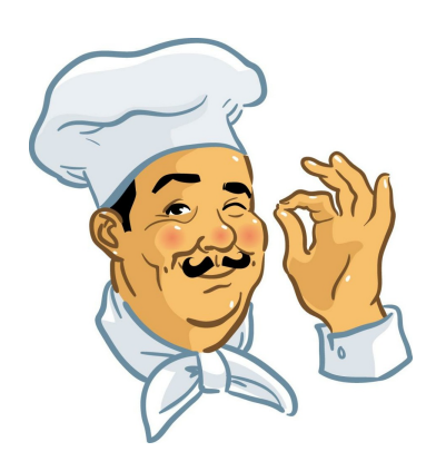
Gumbo Cook-Off Winners