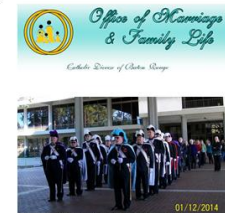
The living Rosary from last year's event.

Please contact the Marriage & Family Life Office for more information or with questions.