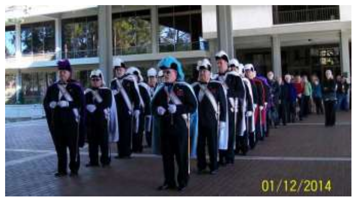
The living Rosary from last year's event.